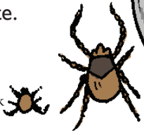
Adult Female tick

Tick bites are dangerous because they can give you diseases like Lyme disease.